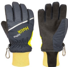
Maris Short PTFE