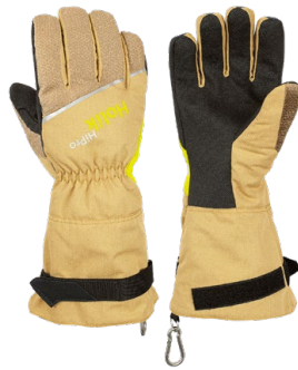
Maris Long Beige PTFE